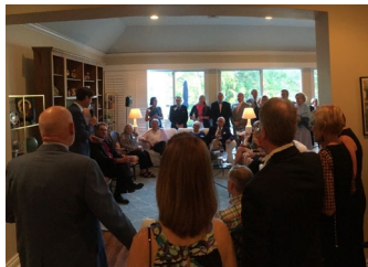
Trinity by the Cove, Naples