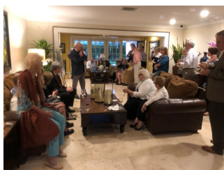
St. Thomas, St. Petersburg