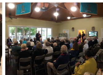
St. Andrew, Boca Grande