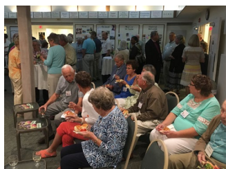
St. Michael & AA, Sanibel