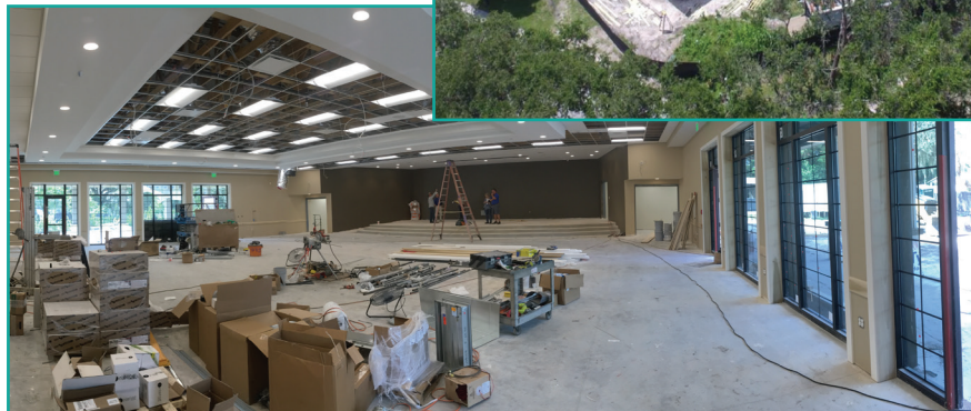
DaySpring Program Center